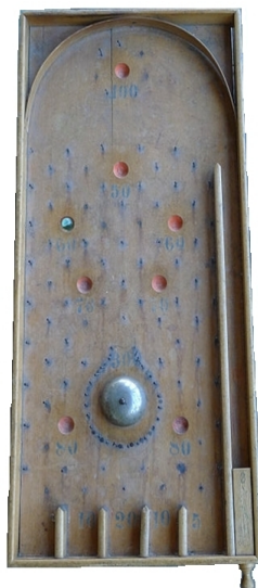
A Stosspudel – a pinball machine.

Gaining a worldview is like a pinball machine where the pins represent each piece of information or experience you receive. These determine where you land at the bottom of the machine, where the slots represent the various broad worldviews.