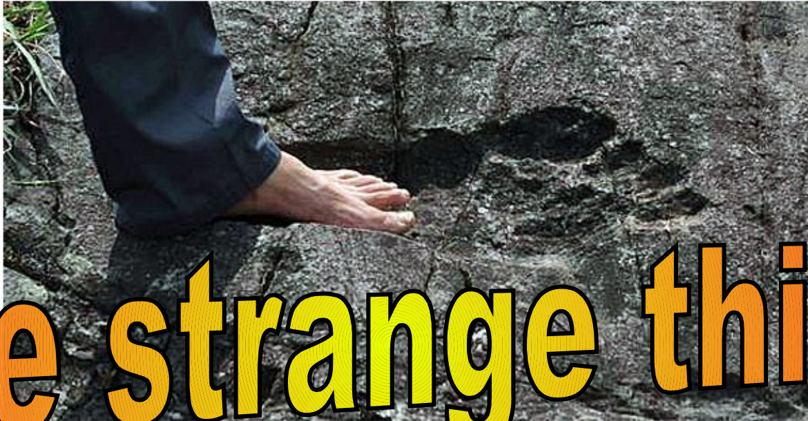
A man stands in a mysterious giant footprint in bedrock in China