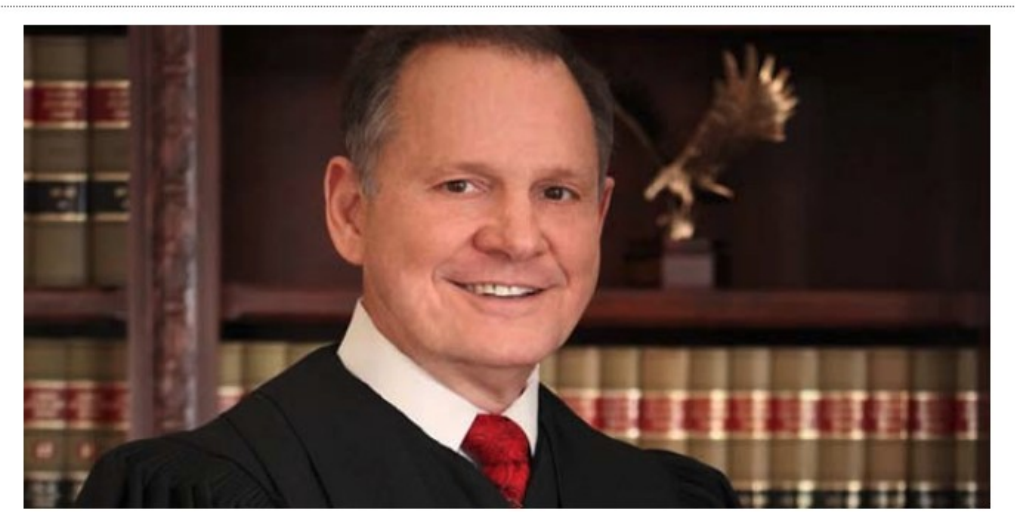
Judge Roy Moore