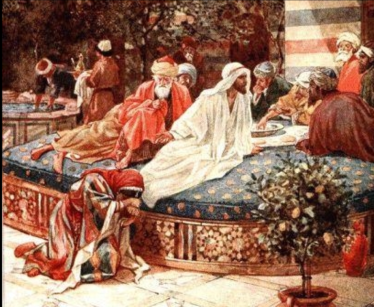
Bringing sinners into the Kingdom