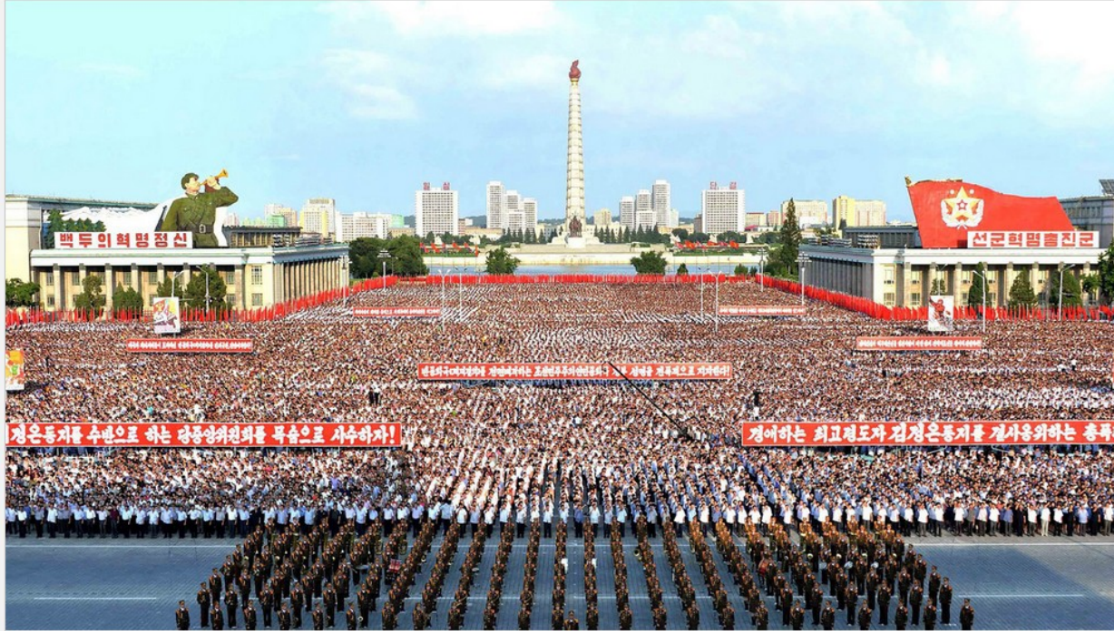
A rally in support of North Korea's stance against the US, on Kim Il-Sung square in Pyongyang, North Korea on August 10