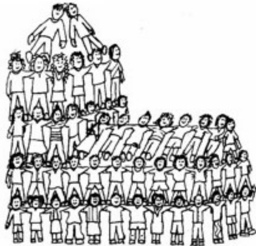
The house of God made of living stones

Today, however, we are learning to be submitted to the Lord and comply with his directives, not those that people have set up.