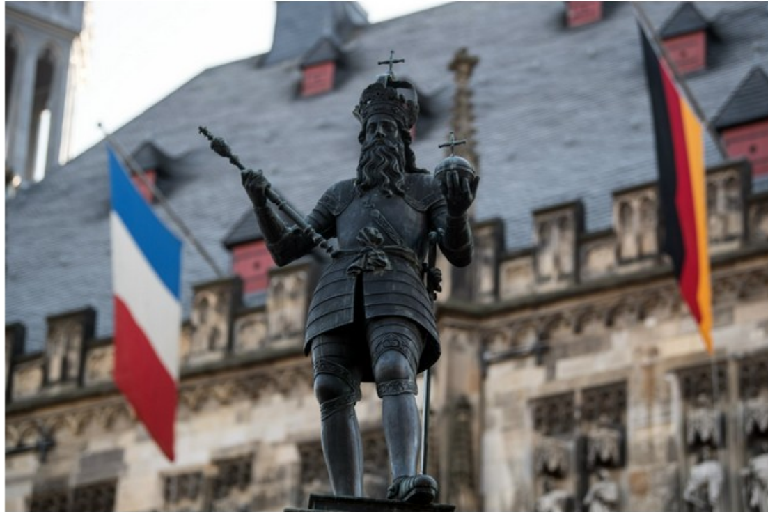
A German and a French flag hang behind the figure of Charlemagne at Aachen town hall.