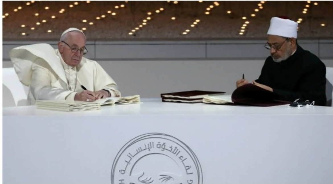
Pope Francis and Grand Imam of al-Azhar Sheikh Ahmed al-Tayeb signing a document on fighting extremism, during an inter-religious meeting.

“Therefore, the fact that people are forced to adhere to a certain religion or culture must be rejected, as too the imposition of a cultural way of life that others do not accept”