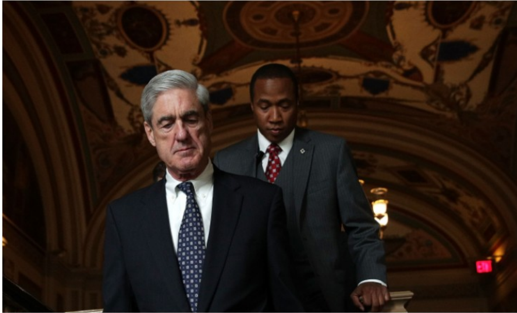
Special counsel Robert Mueller (L) arrives at the U.S. Capitol for closed meeting with members of the Senate Judiciary Committee in Washington on June 21, 2017.