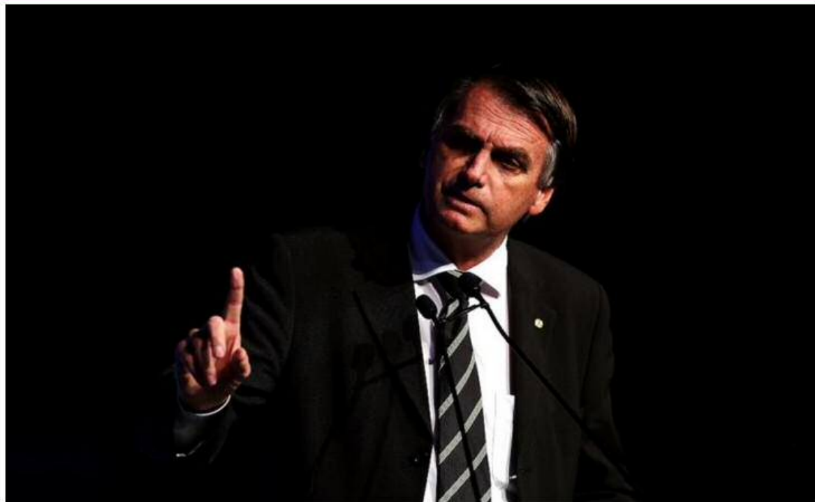
President Jair Bolsonaro of Brazil.