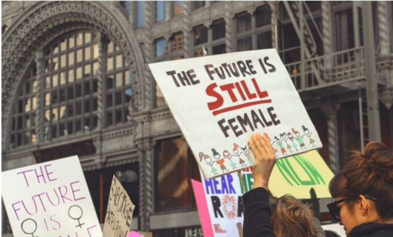
Participants in the Women's March 2018 hold signs saying "The Future is Female." Men and traditional masculinity are under attack, concludes Nicole Russell, after reading GQ's latest issue on masculinity.