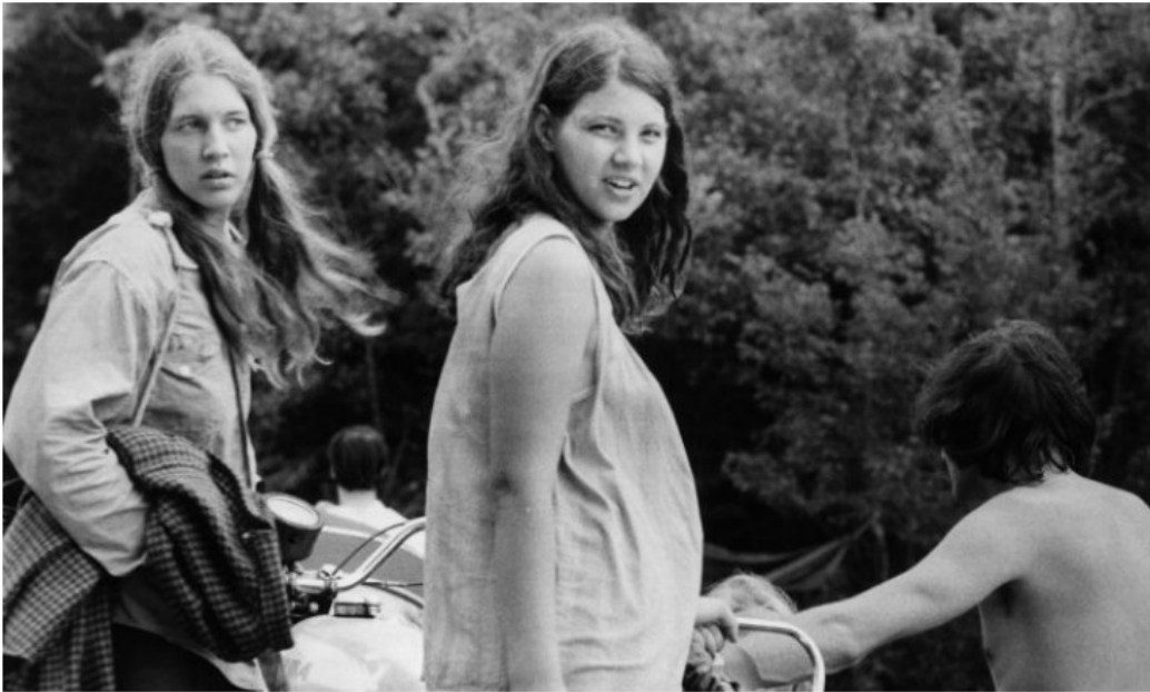
August 1969: A pregnant woman and her friend wait as a motorcycle is unhitched from a car, as they prepare to leave Max Yasgur's Bethel farm and the Woodstock music festival.