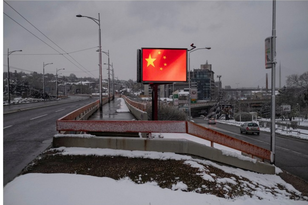
A Chinese flag on a billboard in Serbia last month.

A revised report shows how Beijing reacts swiftly and effectively to tamp down Western criticism of its pandemic response.