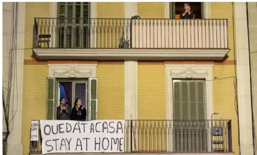
▲ 'Stay at home': Spain has already imposed quarantine rules, whereby citizens are allowed out only to buy essential goods, for medical care or to go to work. The UK government has not yet ordered such drastic measures.