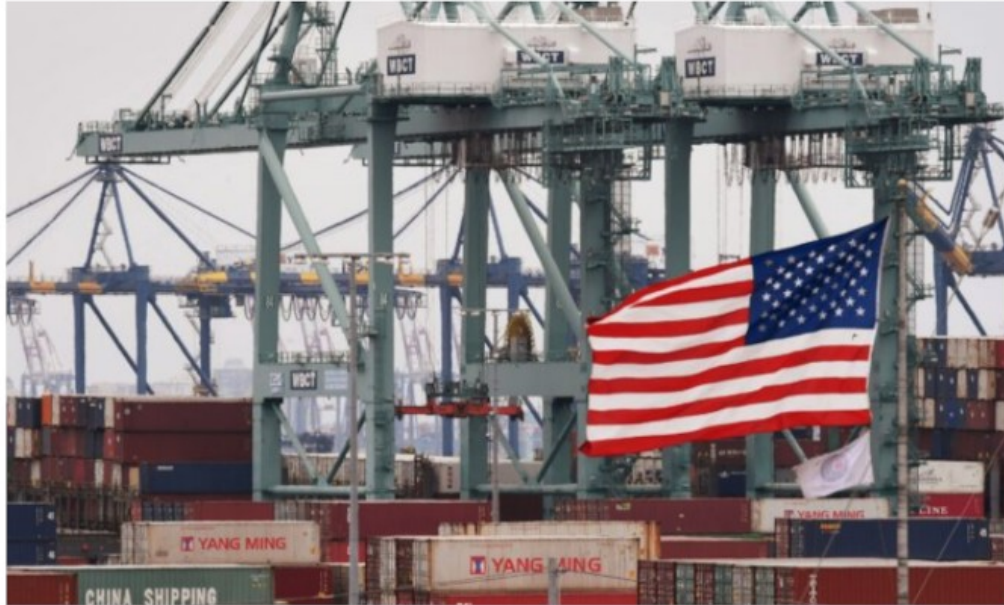
Chinese shipping containers are stored beside a US flag after they were unloaded at the Port of Los Angeles in Long Beach, Calif., on May 14, 2019.