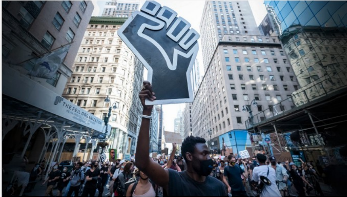
A protester holds a large black power raised fist through the streets of 5th Avenue in New York with hundreds of other protesters.