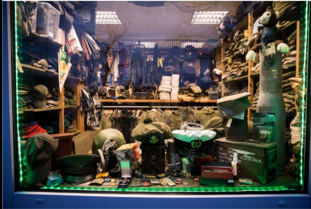
A military accessory shop in Schwerin whose owner was part of the Nordkreuz group.

Germany has woken up to a problem of far-right extremism in its elite special forces. But the threat of neo-Nazi infiltration of state institutions is much broader.