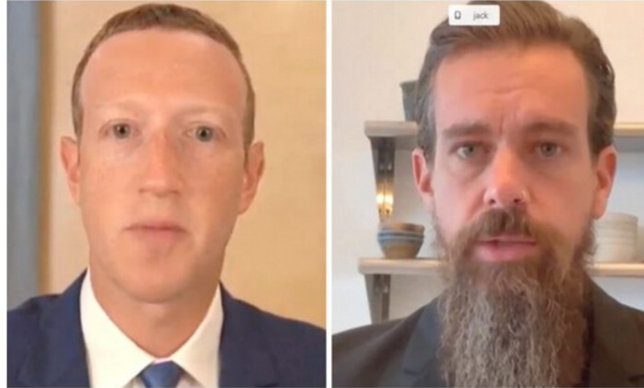
Facebook CEO Mark Zuckerberg (L) and Twitter CEO Jack Dorsey (R) testify before the Senate Judiciary Committee in Washington on Nov. 17, 2020.