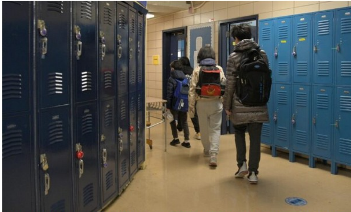
Students file into their classroom at a school in New York City on Feb. 25, 2021.