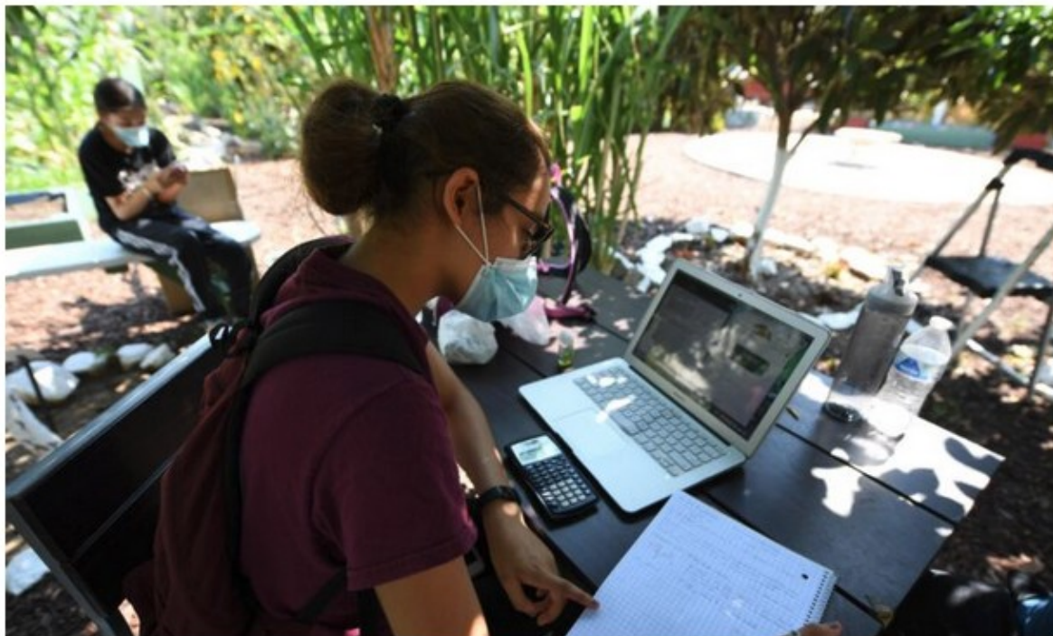
A college student follows a remote class in Los Angeles on Aug. 14, 2020.