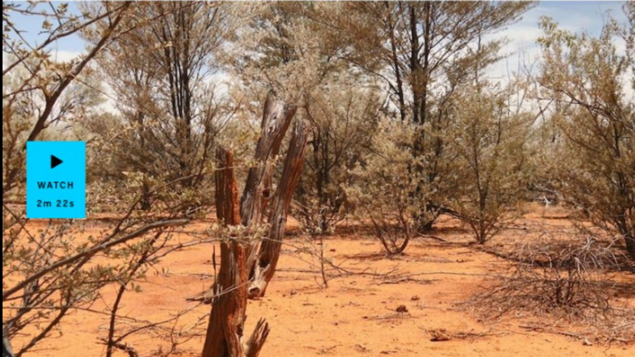
Paroo Shire fights back against the corporatisation of its landscape.