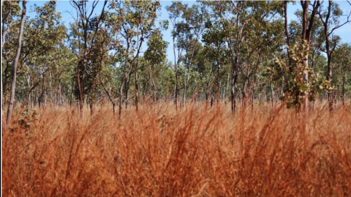
A carbon project on a property in western NSW. The price of Australian carbon credits has fallen more than 30 per cent.